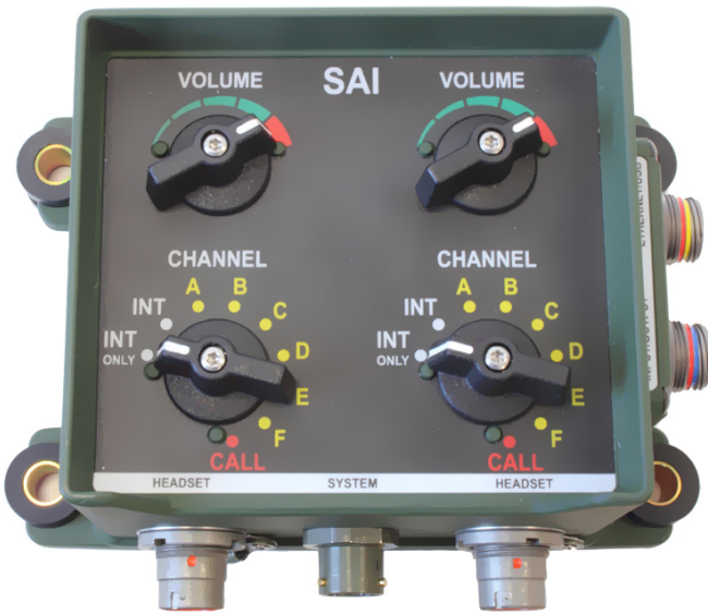
AT VICM 208 - SAI - Sophisticated Alarm Interface - Military Intercom

-40°C to +71°C MIL-STD-461E, MIL-STD-810F