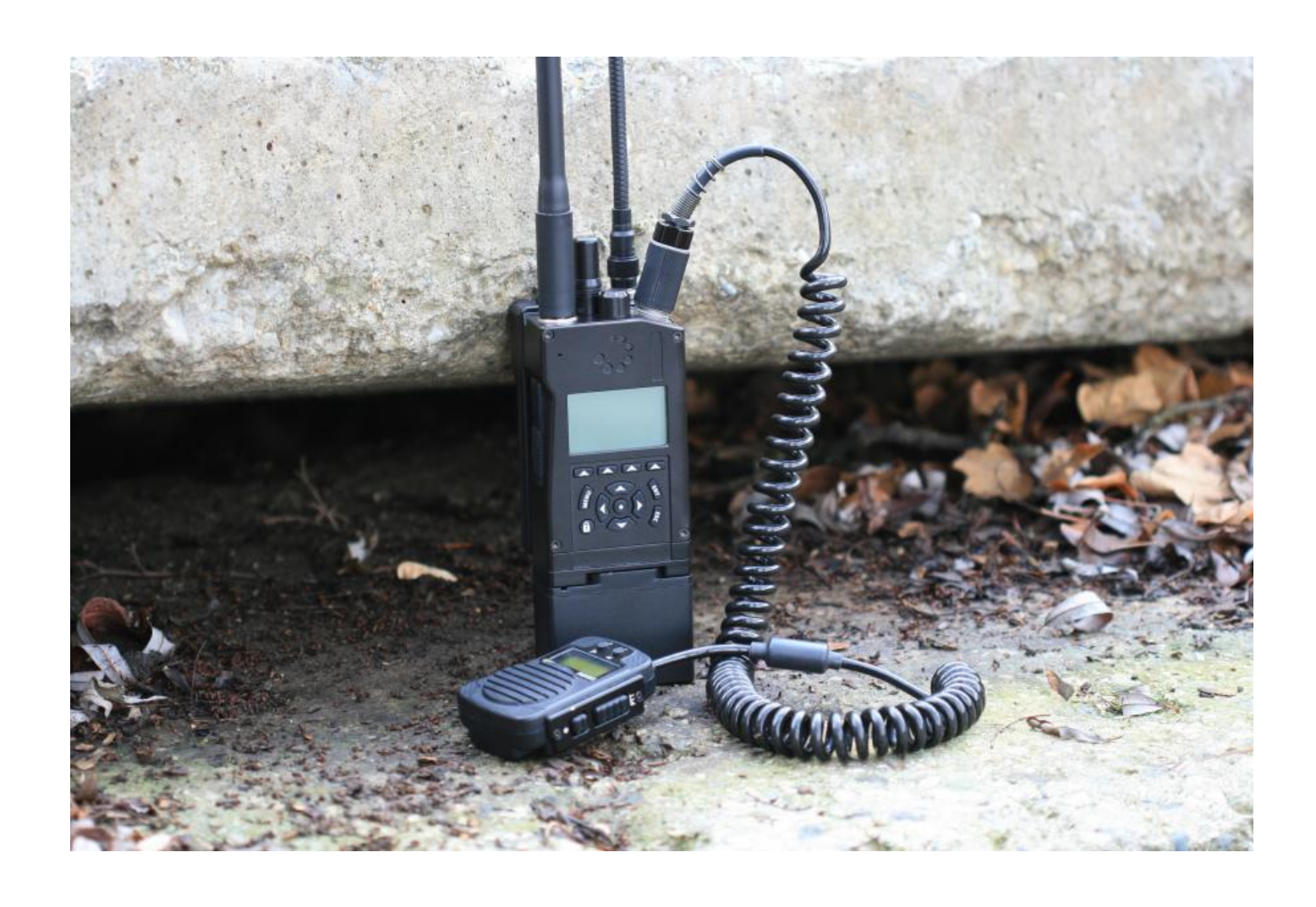
AT RF40 - Handheld Radio - VHF - UHF