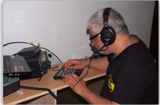
EP2LMA & EP3MIR