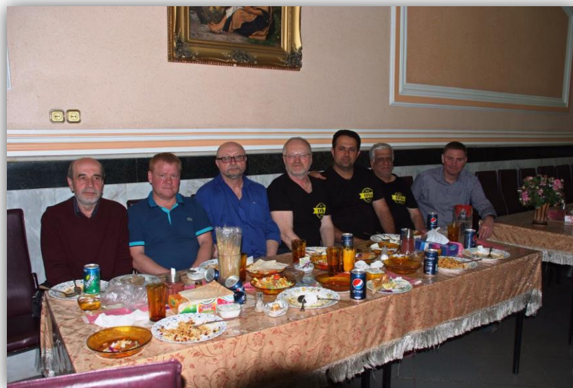
EP2A Ceremonial dinner

Its 420km drive ahead to the airport and in some places the road is traffic heavy, so it's a bit nervous because we still have to deal with the customs in airport. However, everything goes smooth and we manage to save up some time. EP2LMA has planned farewell dinner and asks what we would like – fast food or traditional Iran kitchen. The answer is unequivocal and we head for a traditional food restaurant. Sumptuous served table and sincere people wait as there.