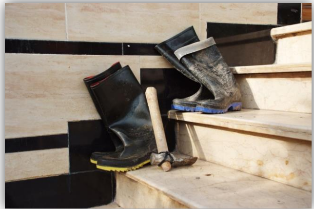
Pictures: Yard with sun shed where we rest. Protection against moving cables in the antenna field – snakes.

Its 420km drive ahead to the airport and in some places the road is traffic heavy, so it's a bit nervous because we still have to deal with the customs in airport. However, everything goes smooth and we manage to save up some time. EP2LMA has planned farewell dinner and asks what we would like – fast food or traditional Iran kitchen. The answer is unequivocal and we head for a traditional food restaurant. Sumptuous served table and sincere people wait as there.